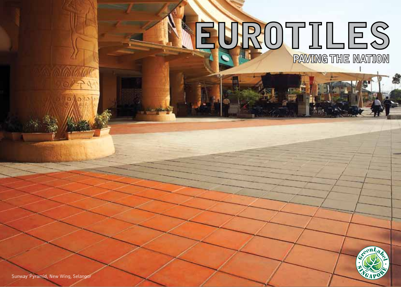
Sunway Pyramid, New Wing, Selangor